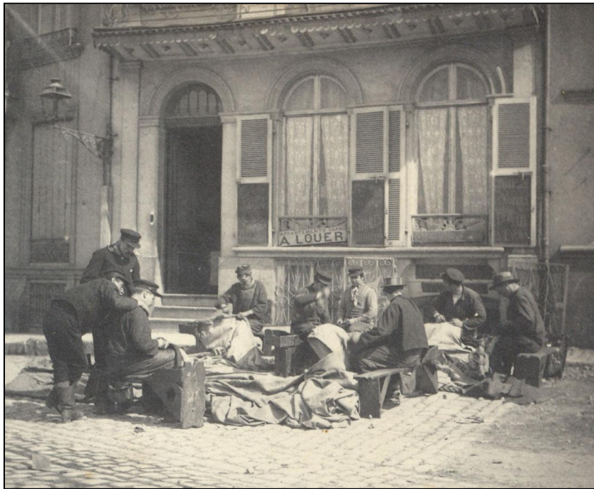
A photograph from the Samuel Butler Collection

Look at this picture carefully. What story does it tell? Your challenge is to translate the photo-story into words. Use the questions below to get started... and don't forget to use your imagination!