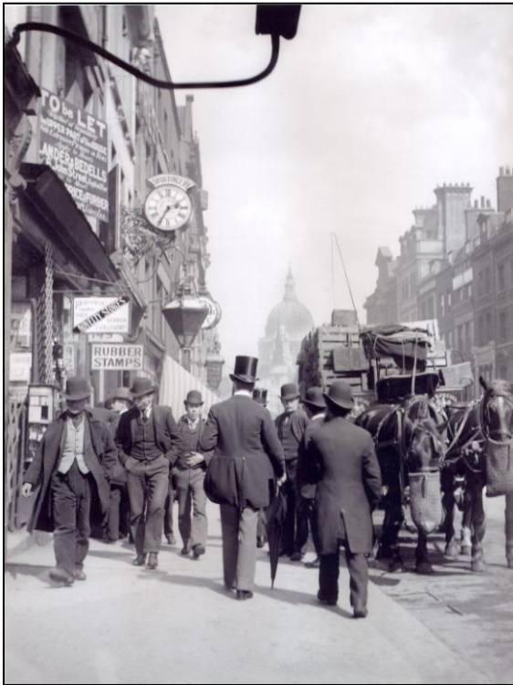
A photograph from the Samuel Butler Collection

Look at this picture carefully. What story does it tell? Your challenge is to translate the photo-story into words. Use the questions below to get started... and don't forget to use your imagination!