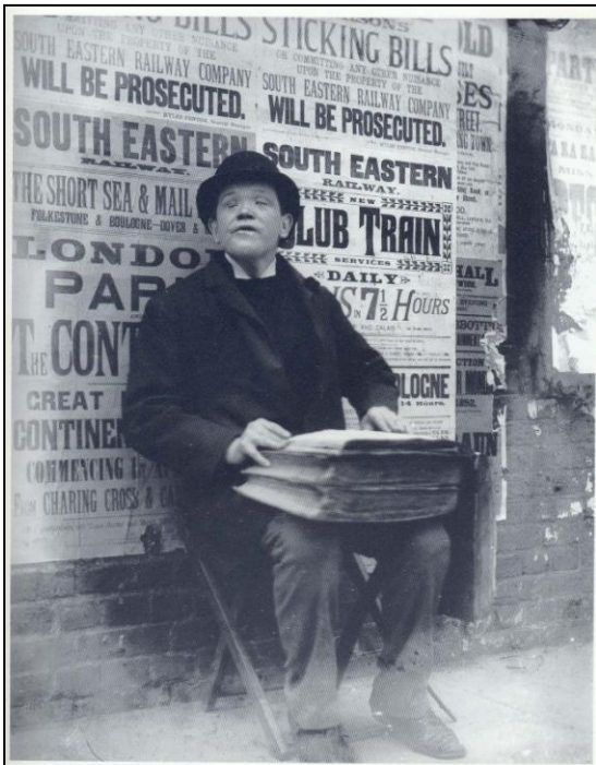
A photograph from the Samuel Butler Collection

Look at this picture carefully. What story does it tell? Your challenge is to translate the photo-story into words. Use the questions below to get started... and don't forget to use your imagination!